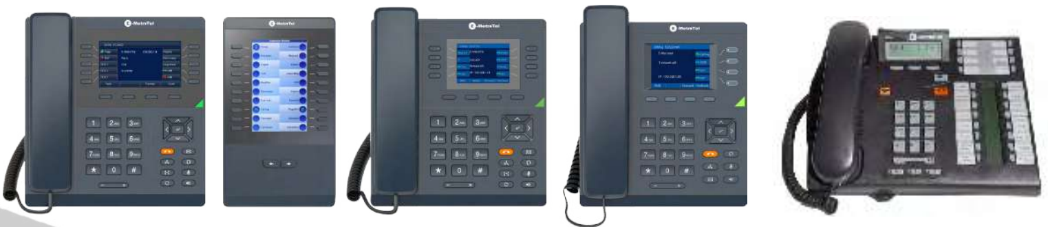
Infinity 5000 Series devices: 5010W, 5042 Module, 5008, 5004. 7316 Digital Device

Efficient tools to increase your office productivity.