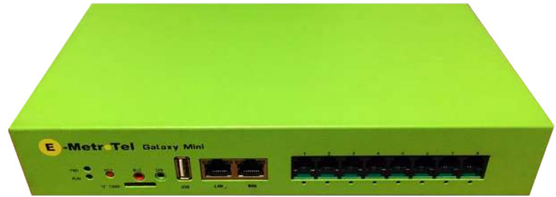
Above: Galaxy Mini server Below: Galaxy Mini server with DSM16 Digital Gateway for digital telephones and 7316 Digital telephone, Infinity 5010 IP telephone.

Because of its unique digital capabilities combined with support for internet telephony, Galaxy Mini it is a perfect platform for migration from an older digital system or for completely replacing your current IP system.