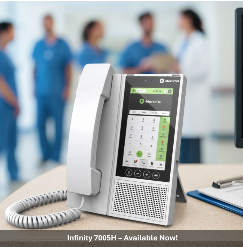
Infinity 7005H – Available Now!

Compact design. Clear communication. Everyday usability.