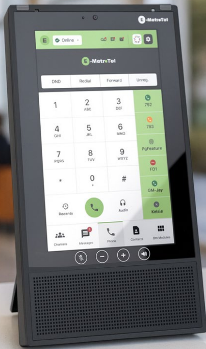
Infinity 7208 – Coming Soon!

With an adjustable 8" HD touchscreen, built-in camera, and adjustable stand, the 7208 is designed for modern video communication and collaboration. Its handset-free, headset-first design adapts easily to call centers, meeting rooms, personal desks, and hybrid work environments.