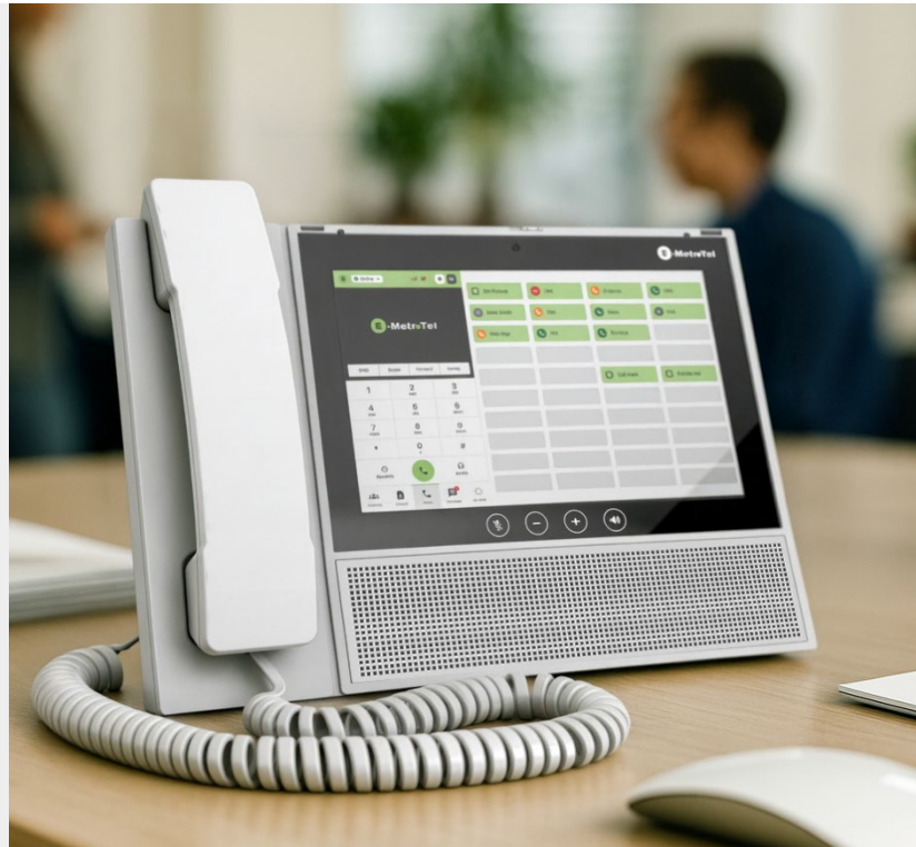
Infinity 7008H – Available Now!