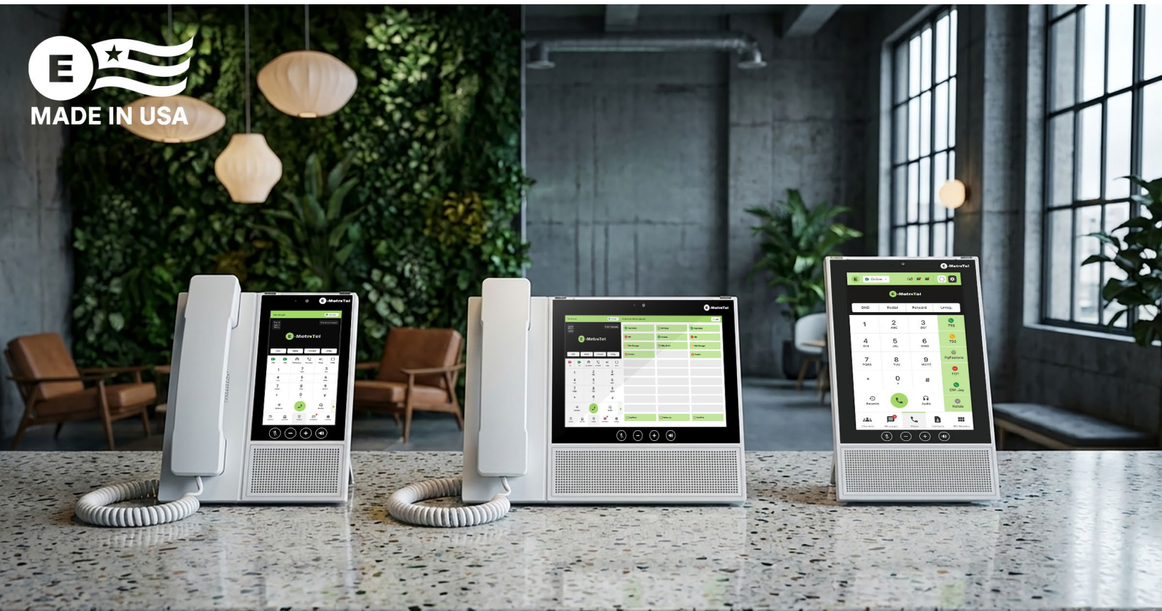
The Infinity 7000 series phones are available in black or white.